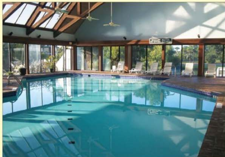
Morning workouts in the resort ambience of the Beachside Health & Fitness Center pool are available six days a week (M/W/F at 8:30 and 9:30 a.m.; T/Th at 7:30 a.m.; Sat. at 8:30 a.m.).

Are you looking for a good water aerobics workout before your day job? Or are you an early riser wanting to get some exercise without wasting half the morning? For the past 19 years, I've taught "Water BodyWorks" at the Litchfield Beach & Golf Resort three days a week at a time when most working folks couldn't participate without showing up for work with wet hair. My new class schedule (Tuesdays and Thursdays, 7:30 to 8:30 a.m., and Saturdays, 8:30 to 9:30 a.m.) solves that problem. Water workouts are recommended by many physicians for weight control, muscle toning, flexibility, joint protection, boosting energy, increasing stamina and post-rehab recovery from injury or surgery. The Water BodyWorks sequence includes warm-up and stretching, sustained low-impact cardio aerobics to big band and beach basic, wall and equipment exercises for strengthening and firming targeted body parts, and cool-down and stretching before heading to the Jacuzzi, sauna, steam room or shower. You can drop-in and try out a class for only $5. For six-month or annual memberships (individual and family) and all the amenities that are included, call the resort's Beachside Health & Fitness Center at 843-235-5541.